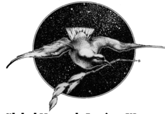
Global Network Against Weapons and Nuclear Power in Space